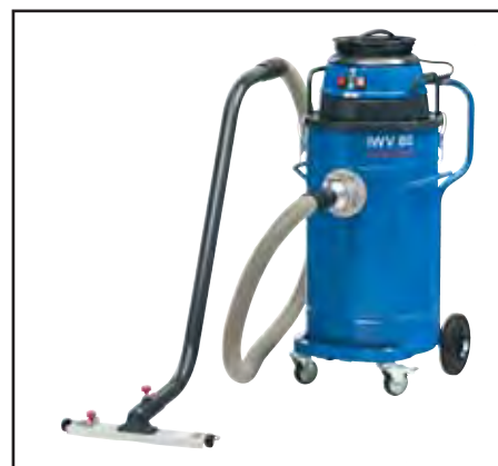
Effective removal of liquids with the floor tool