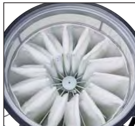
Star filter with 20,000 cm 2 filter surface area