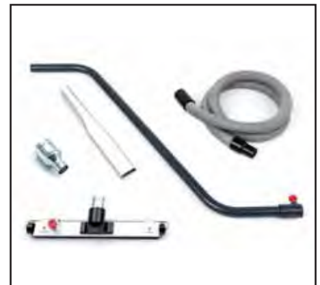
Comprehensive accessories kit for IDV 100