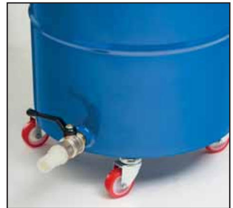
Convenient disposal of cleaned liquids through drain valve