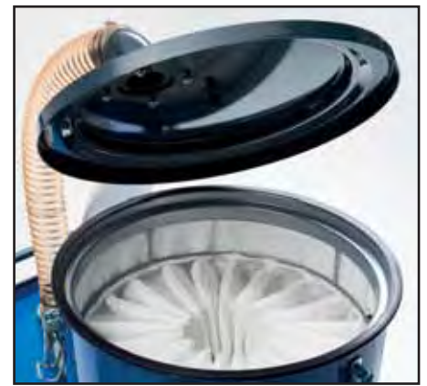
Filter cartridge with 30,000 cm 2 filter surface area