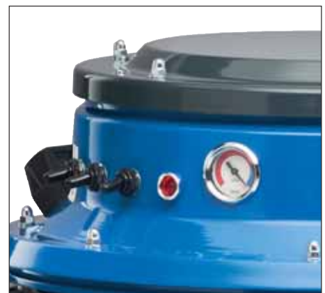
Continuous monitoring of filter clogging with negative pressure indicator