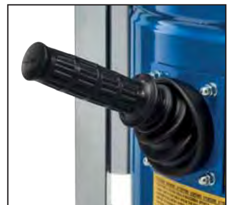
Manual filter shaking to keep suction performance high