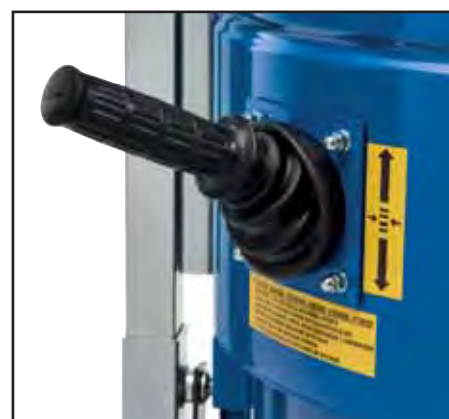
Manual filter shaking for long service life