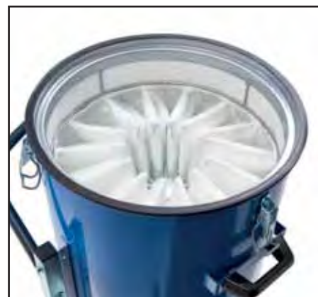
Filter cartridge with 20,000 cm 2 filter surface area