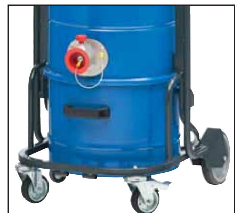
The air flow is diverted to clean the filter.