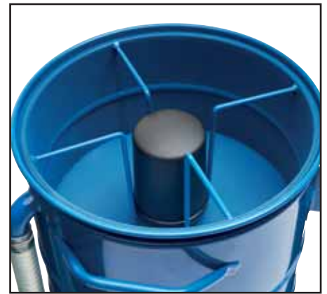
Removable sieve insert to separate liquids and metal chips