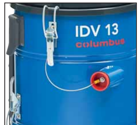
Negative pressure is generated to clean the filter.