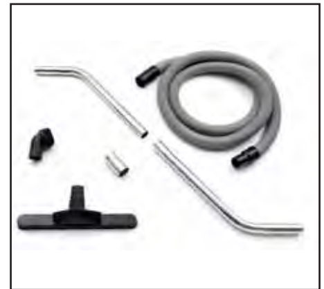
Standard accessories kit for IDV 13