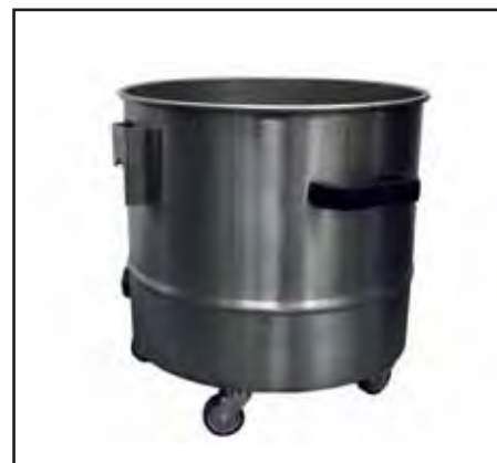
Optional stainless steel container