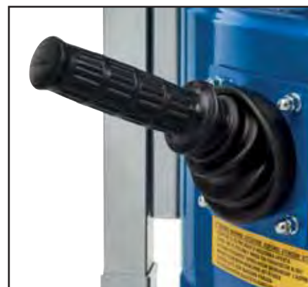
Manual filter shaking to keep suction performance high