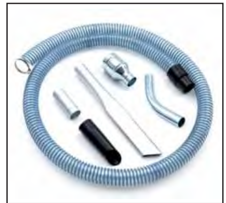
Comprehensive accessories kit for IWV 40/100