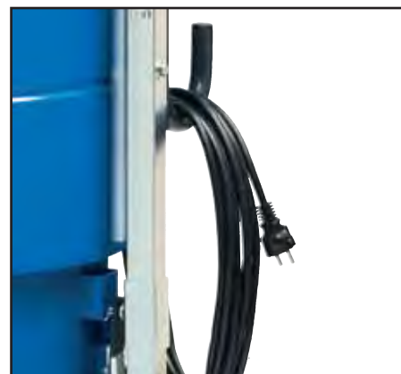
Integrated cable holder