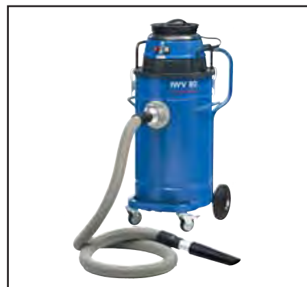
Optional rubber suction tool