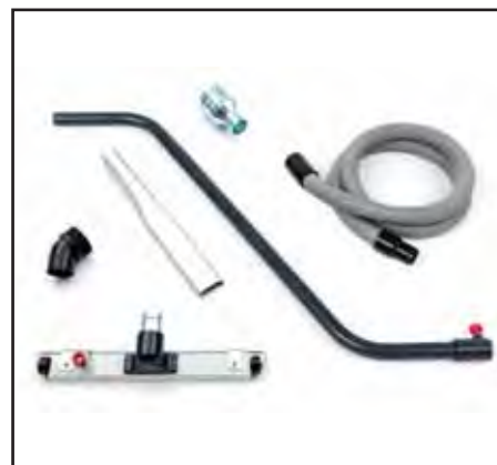
Accessories kit for IWV 80