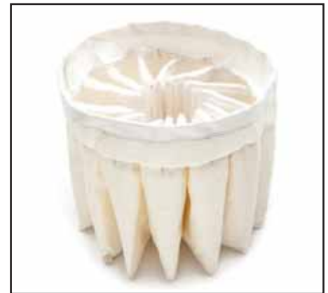
Large star filter made of washable polyester