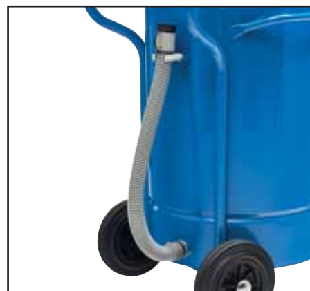
Drain hose from container

Applications: For various wet applications in virtually all industrial sectors