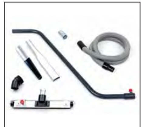
Professional accessories kit for IDV 13