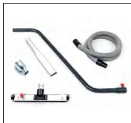
Comprehensive accessories kit for IDV 60