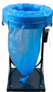
^ PAINTED FIXED v