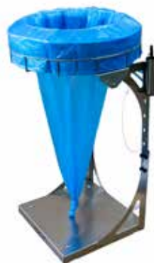
^ INOX FLEX v