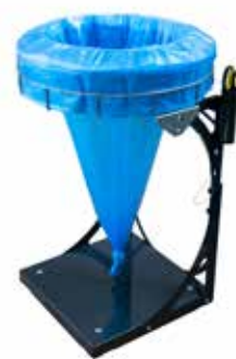
^ PAINTED FLEX v