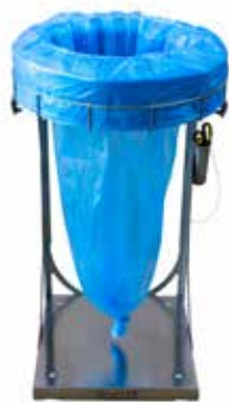
^ INOX FIXED v