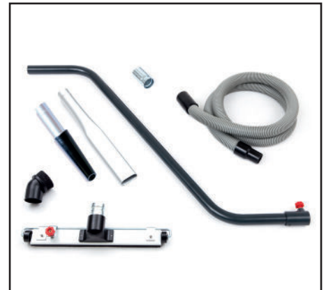
Professional accessories kit for IDV 20