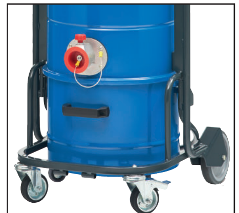
The air flow is diverted to clean the filter.