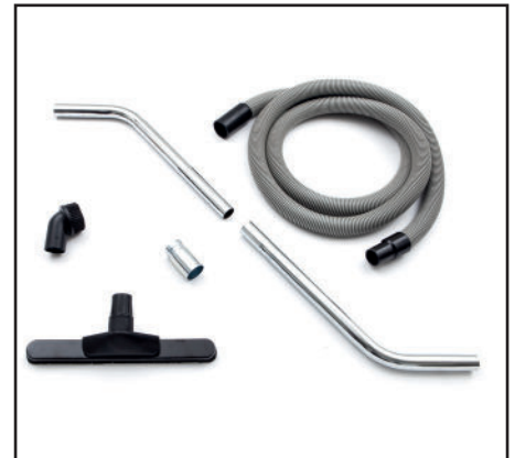
Standard accessories kit for IDV 20