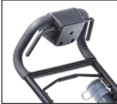
Quick-Stop as standard