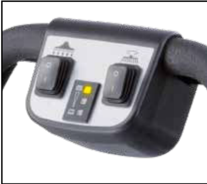
Self explaining control panel